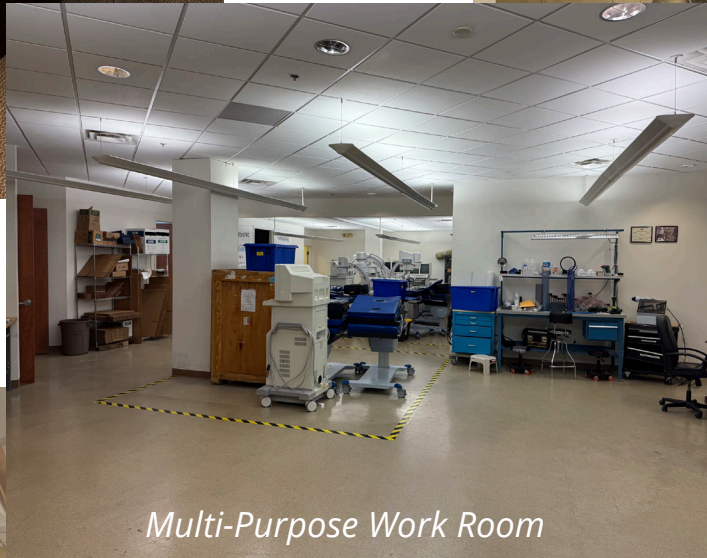
Multi-Purpose Work Room