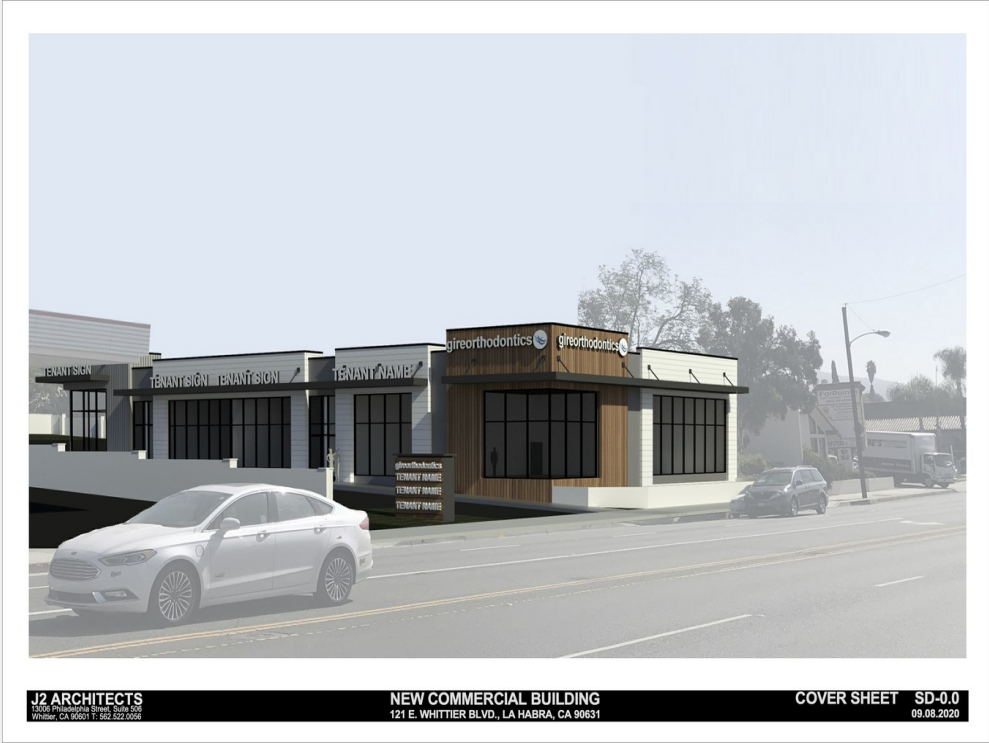
121 E Whittier Blvd_Medical Building for Lease La Habra Commercial Real Estate