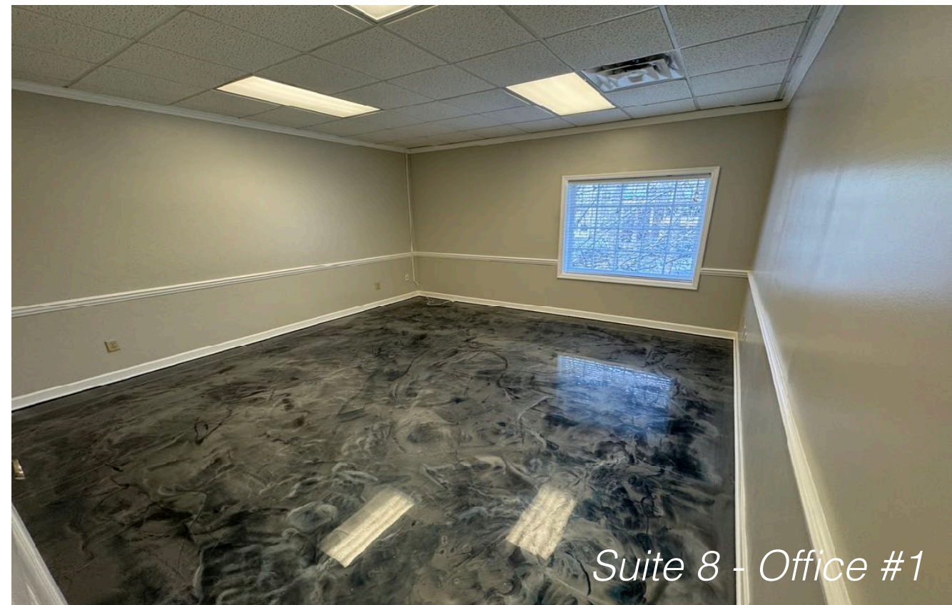
Suite 8 - Office #1