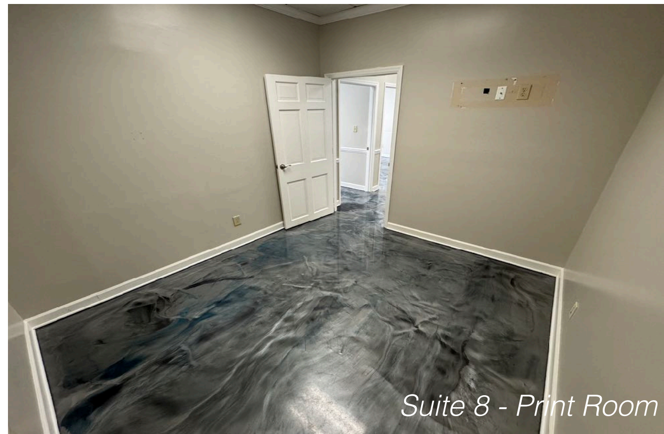
Suite 8 - Print Room