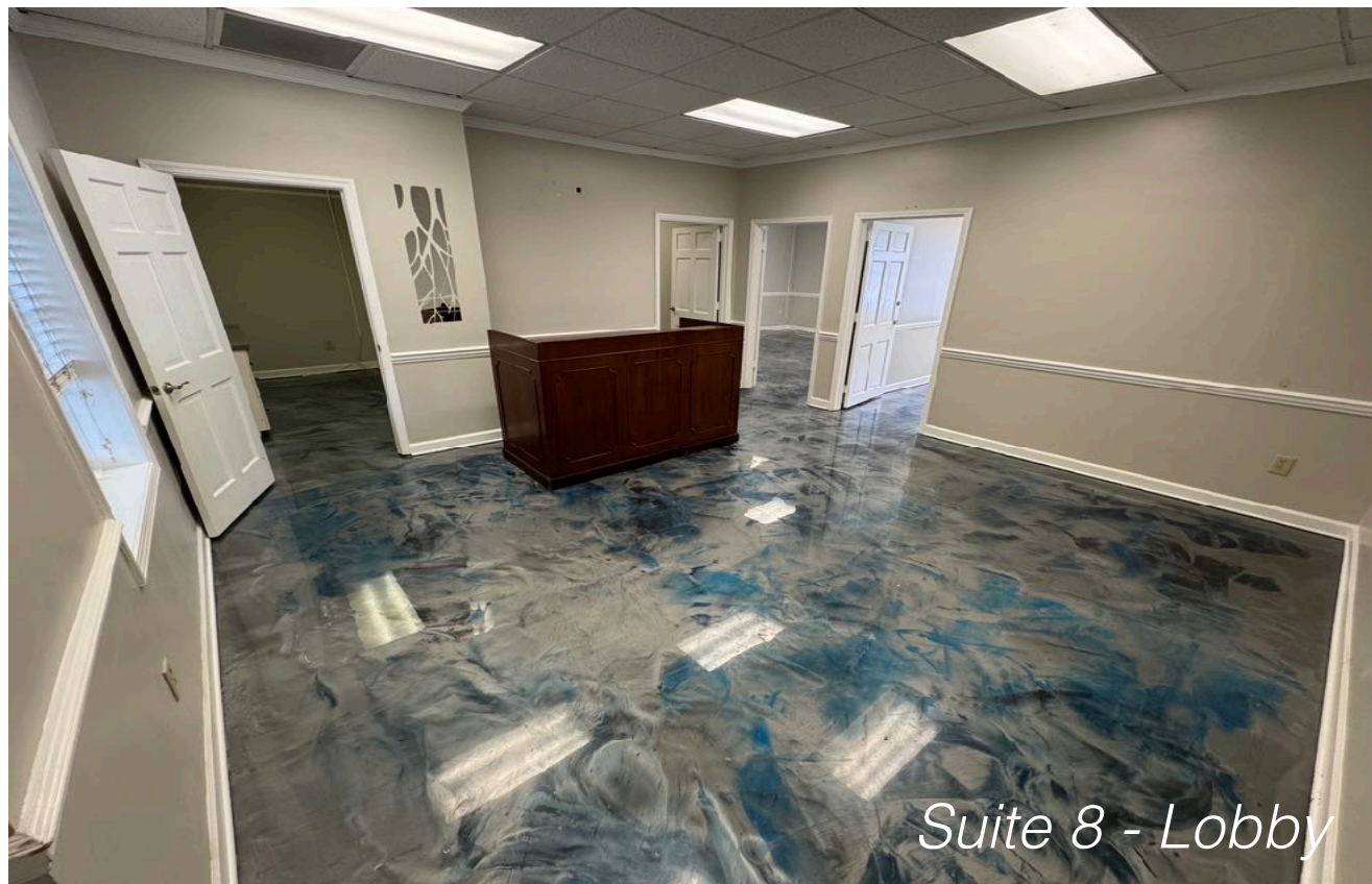
Suite 8 - Lobby