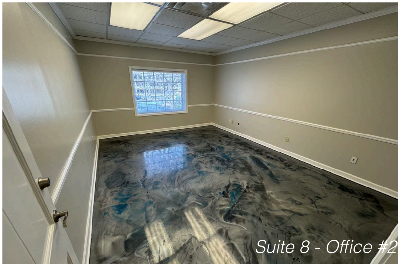
Suite 8 - Office #2