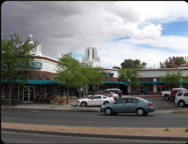
Nob Hill Foods