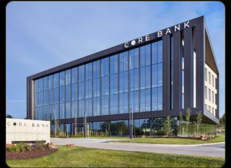
Bank of America