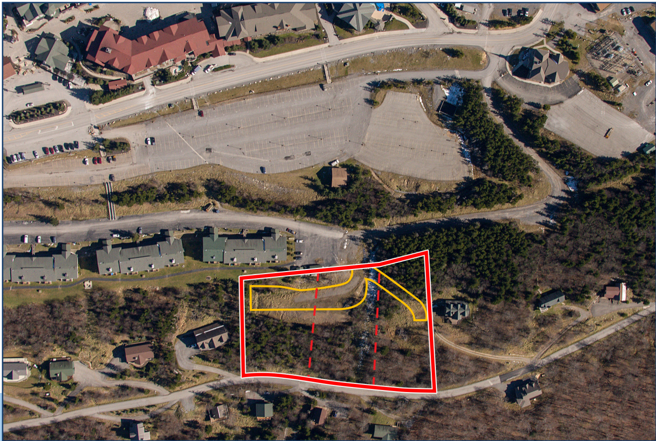
Three - 1 Acre Building Lots Covenants Allow a Main Home and a Smaller "Guest" Home