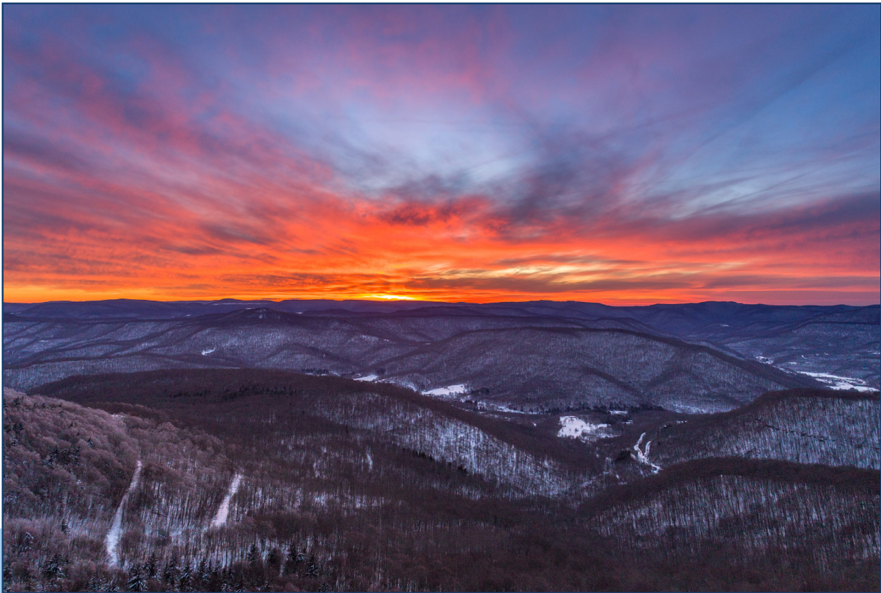
Panoramic Mountain Views