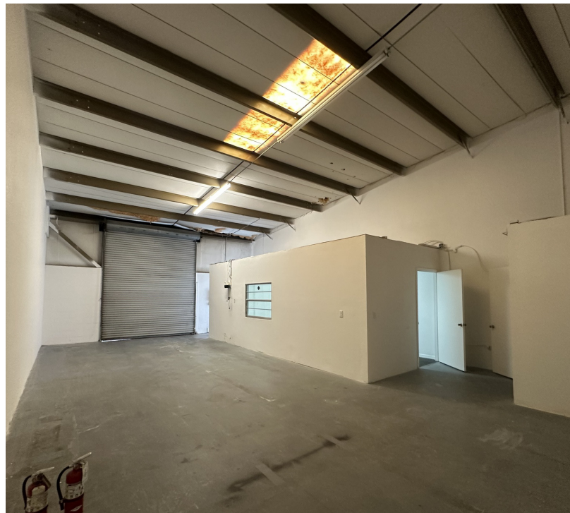
3-N - 1,000 SF