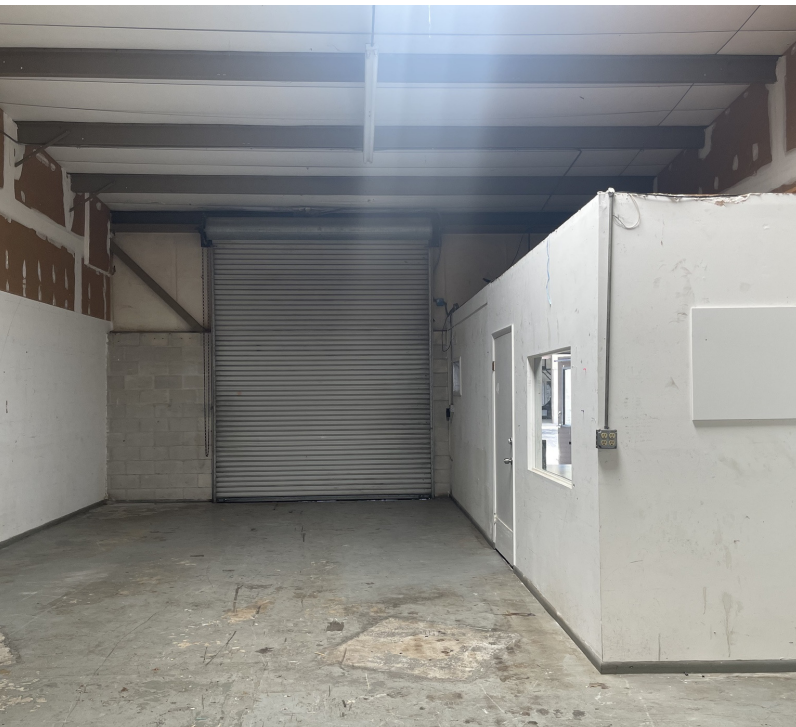
4-D - 1,000 SF