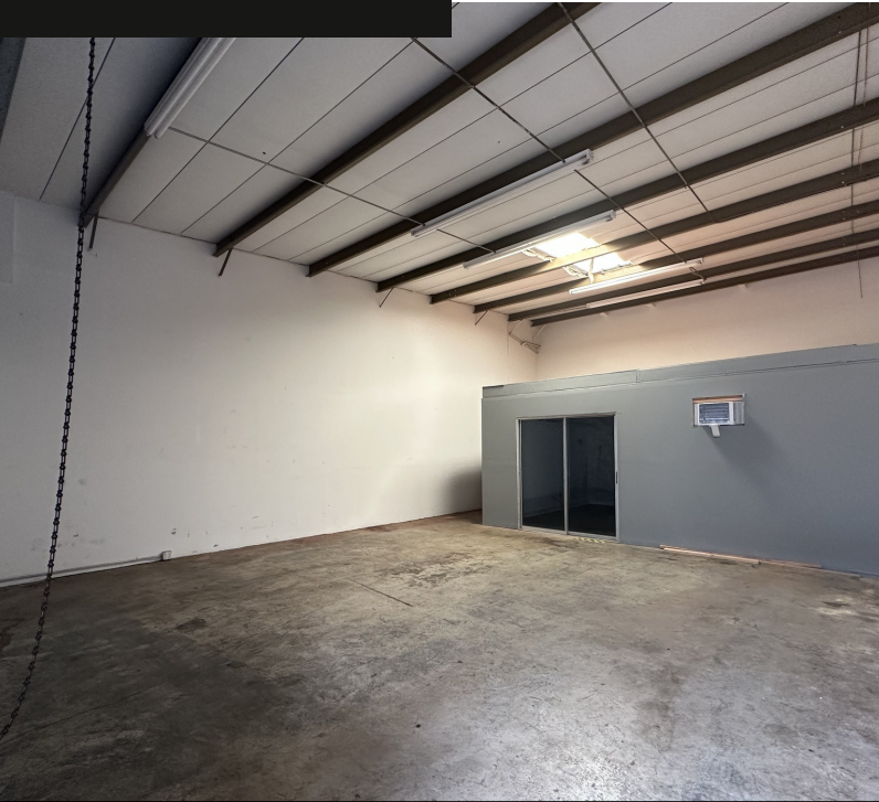
4-O - 1,000 SF