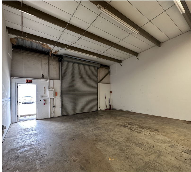
4-O - 1,000 SF