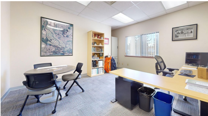
MULTIPLE-SIZED PRIVATE OFFICES