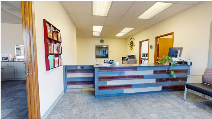
INVITING ENTRY/RECEPTION AREA