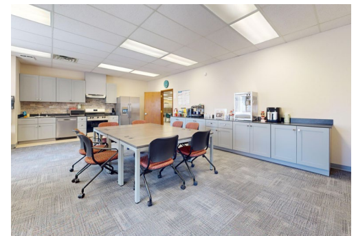
821 AIRPORT CT SE, TUMWATER, WA