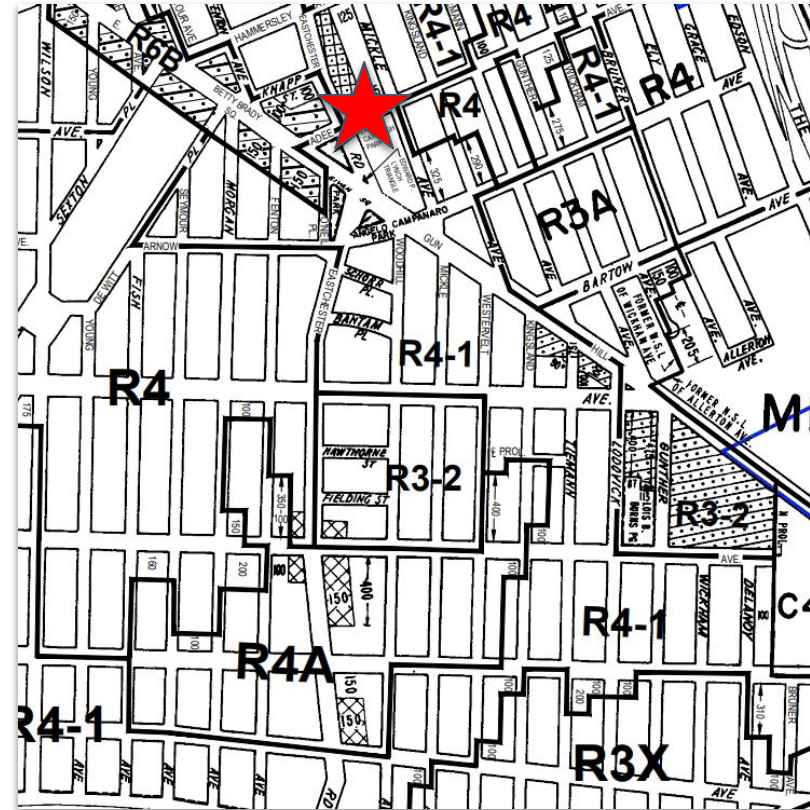
Low-Density Contextual Residence District