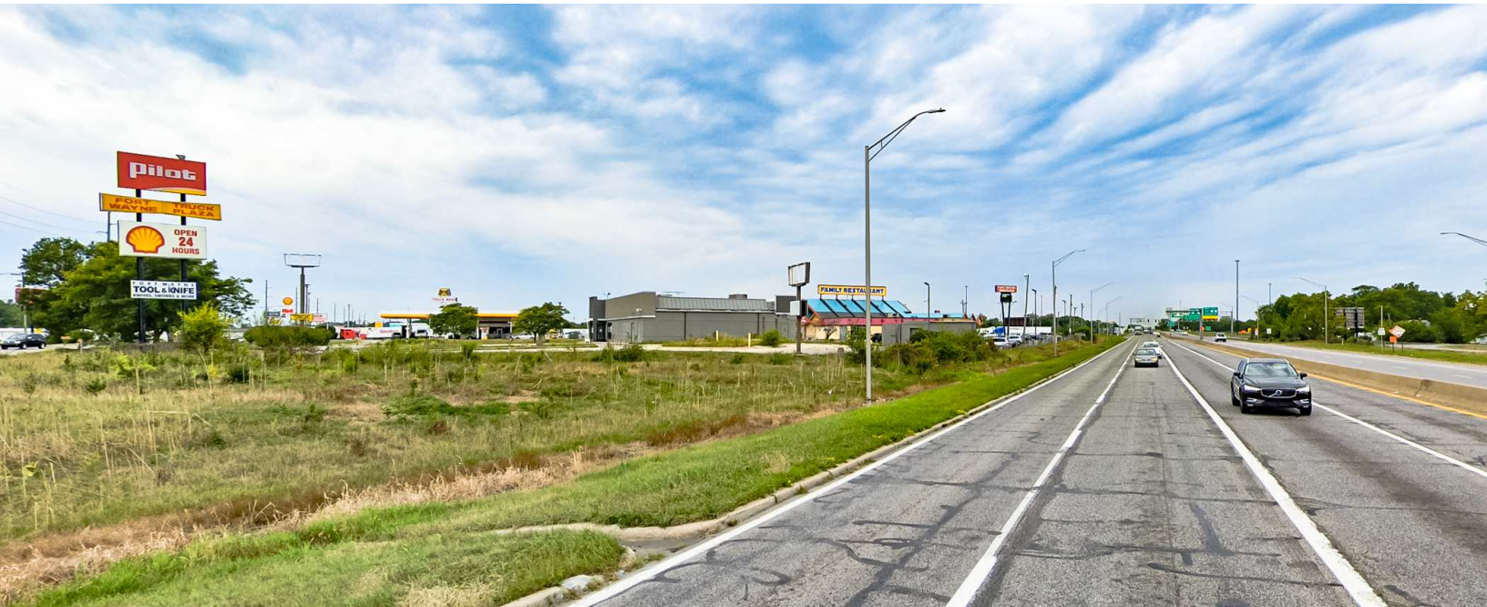
Property View from Goshen Rd (US 30/SR930) at the Interstate 69 Interchange