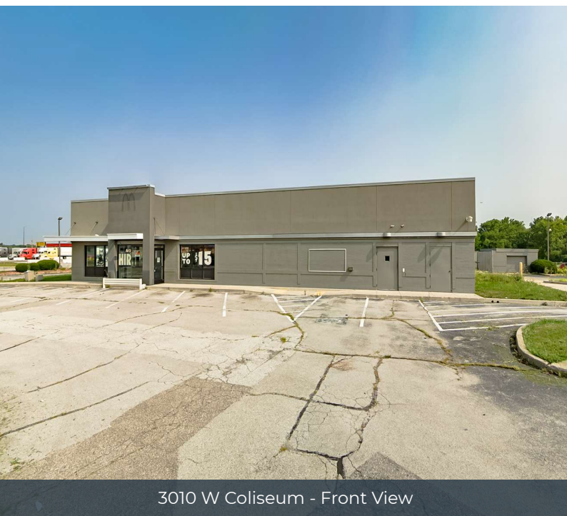
3010 W Coliseum - Front View