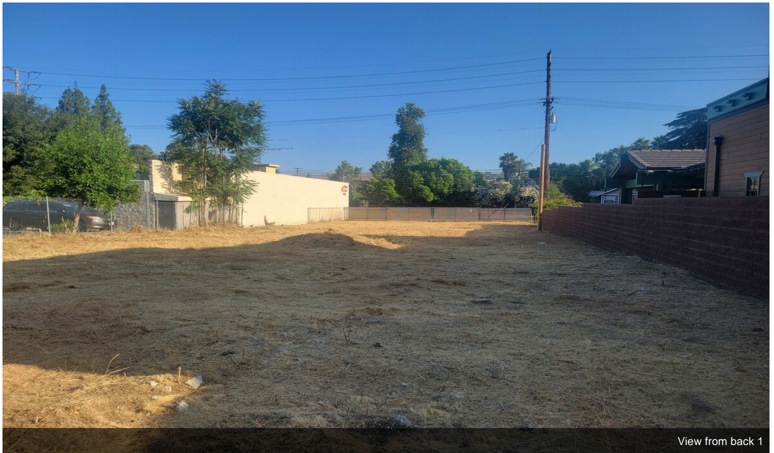
View from back 1