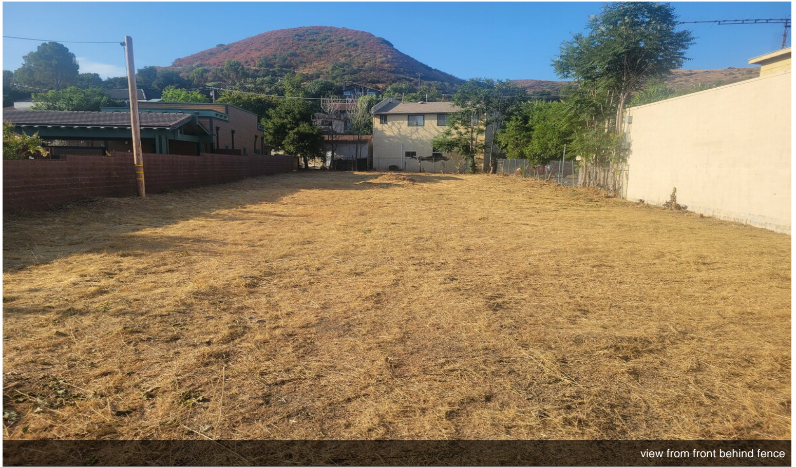
view from front behind fence