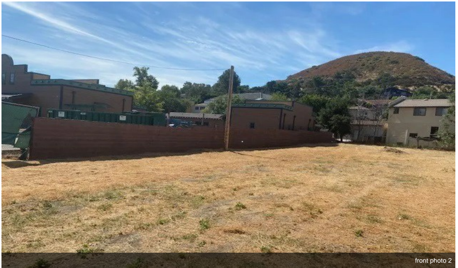
front photo 2