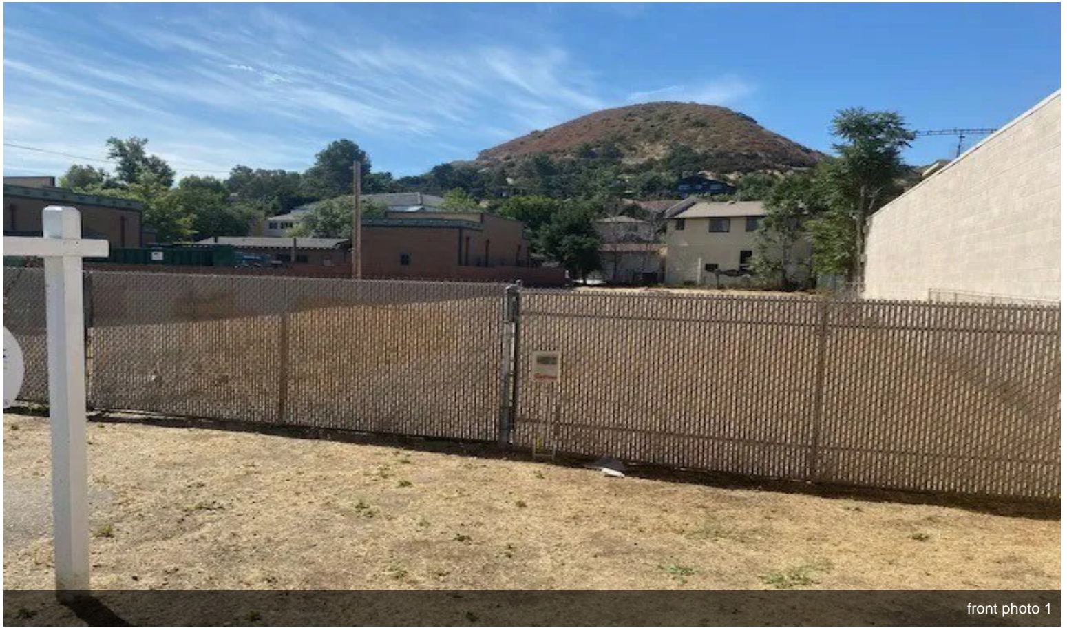
front photo 1