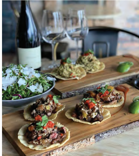
ARC BUTCHER & BAKER