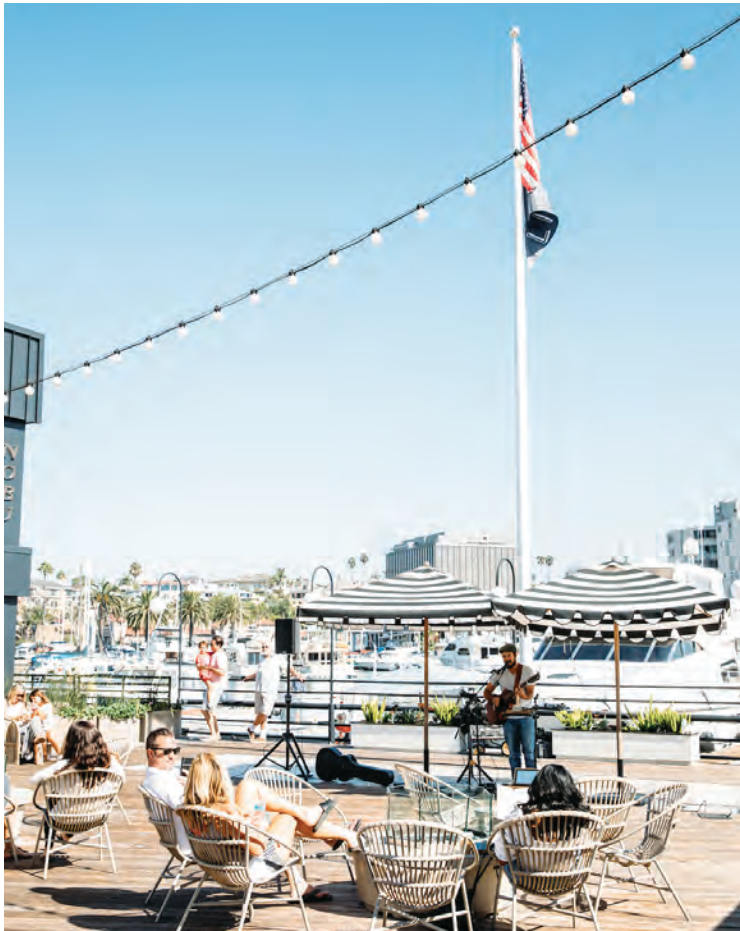
LIDO MARINA VILLAGE