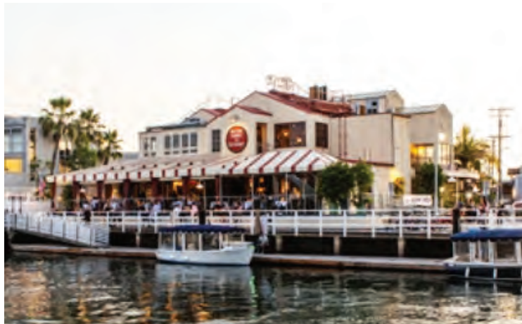
CANNERY SEAFOOD OF THE PACIFIC