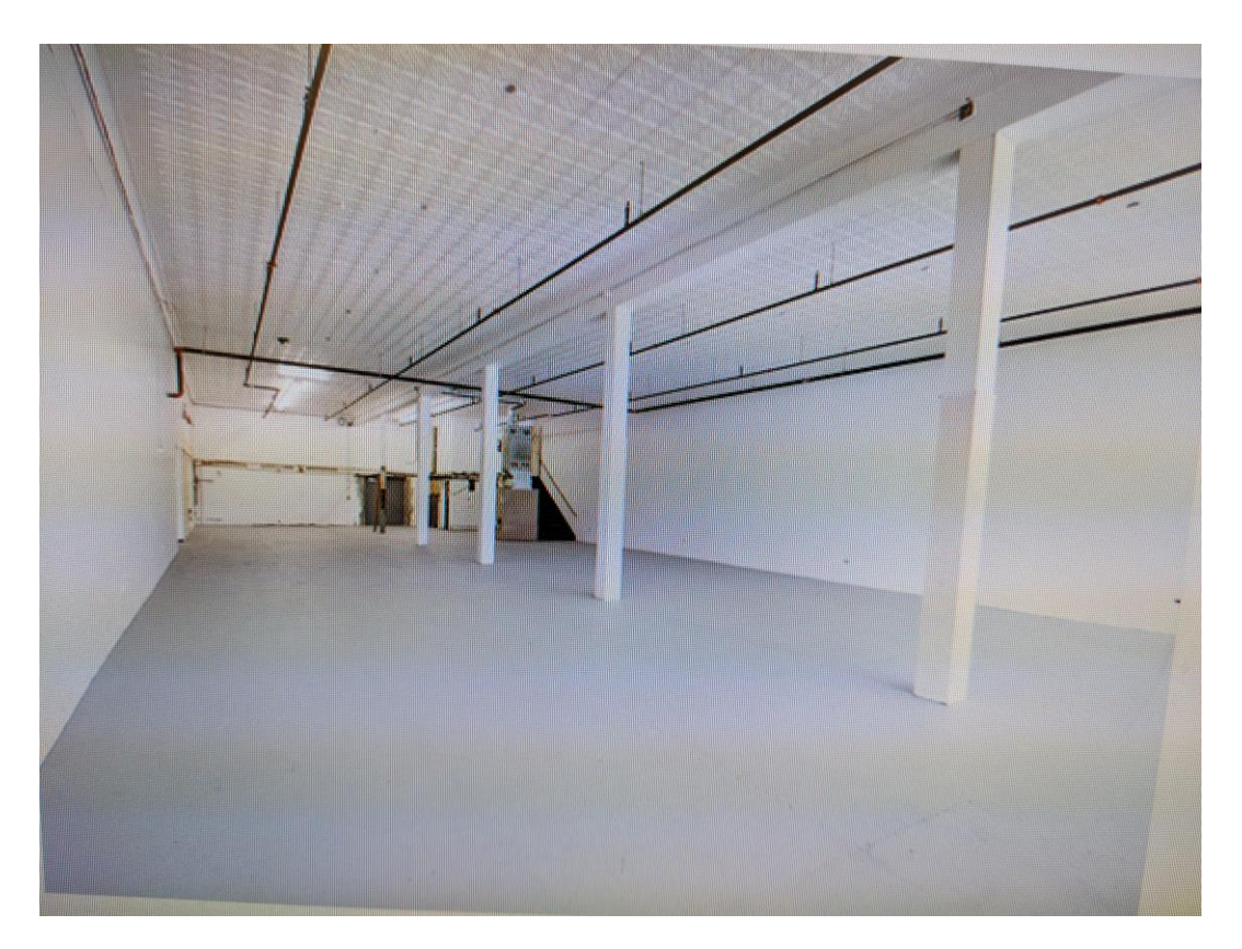
Above- 522 13<sup>th</sup> Street- First floor