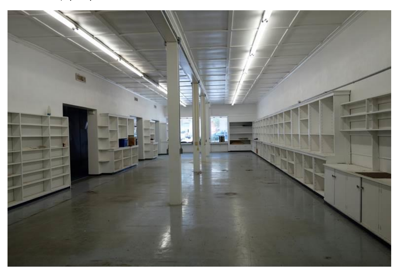
Above- 530 13th Street