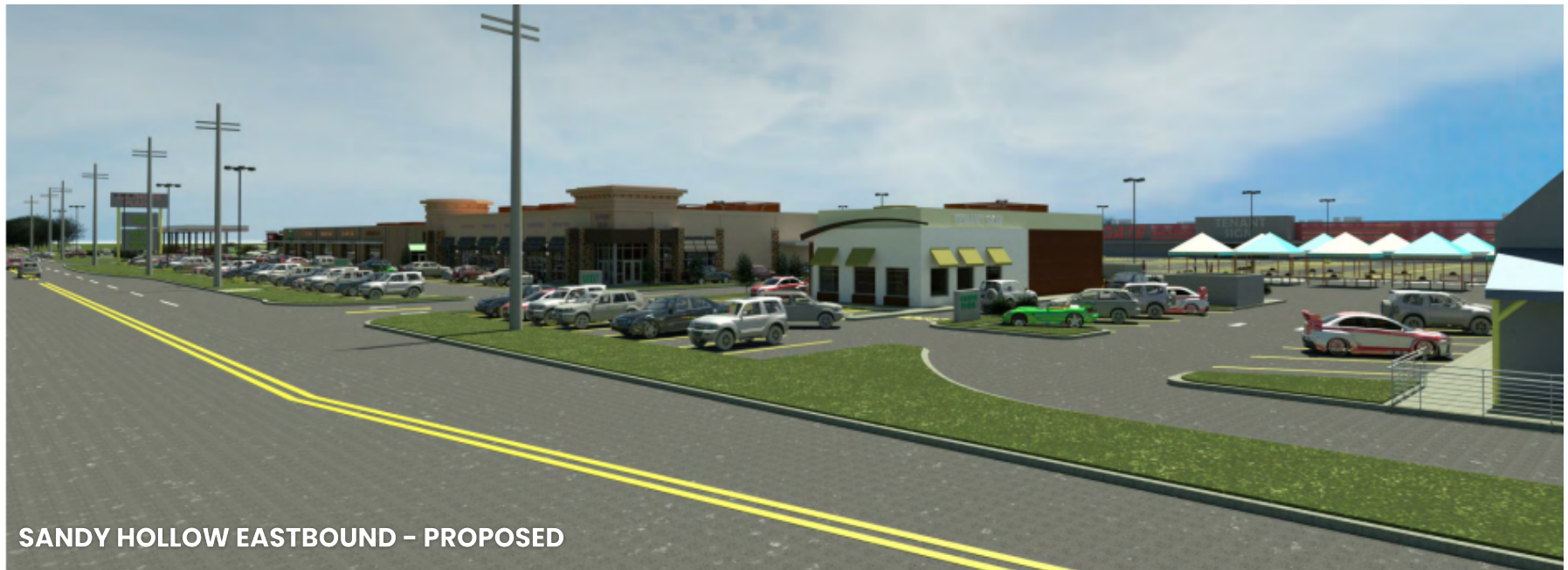
SANDY HOLLOW EASTBOUND - PROPOSED