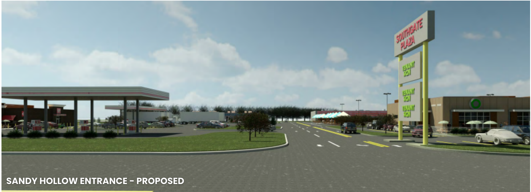
SANDY HOLLOW ENTRANCE - PROPOSED