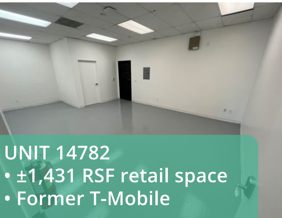
UNIT 14782 • ±1,431 RSF retail space • Former T-Mobile