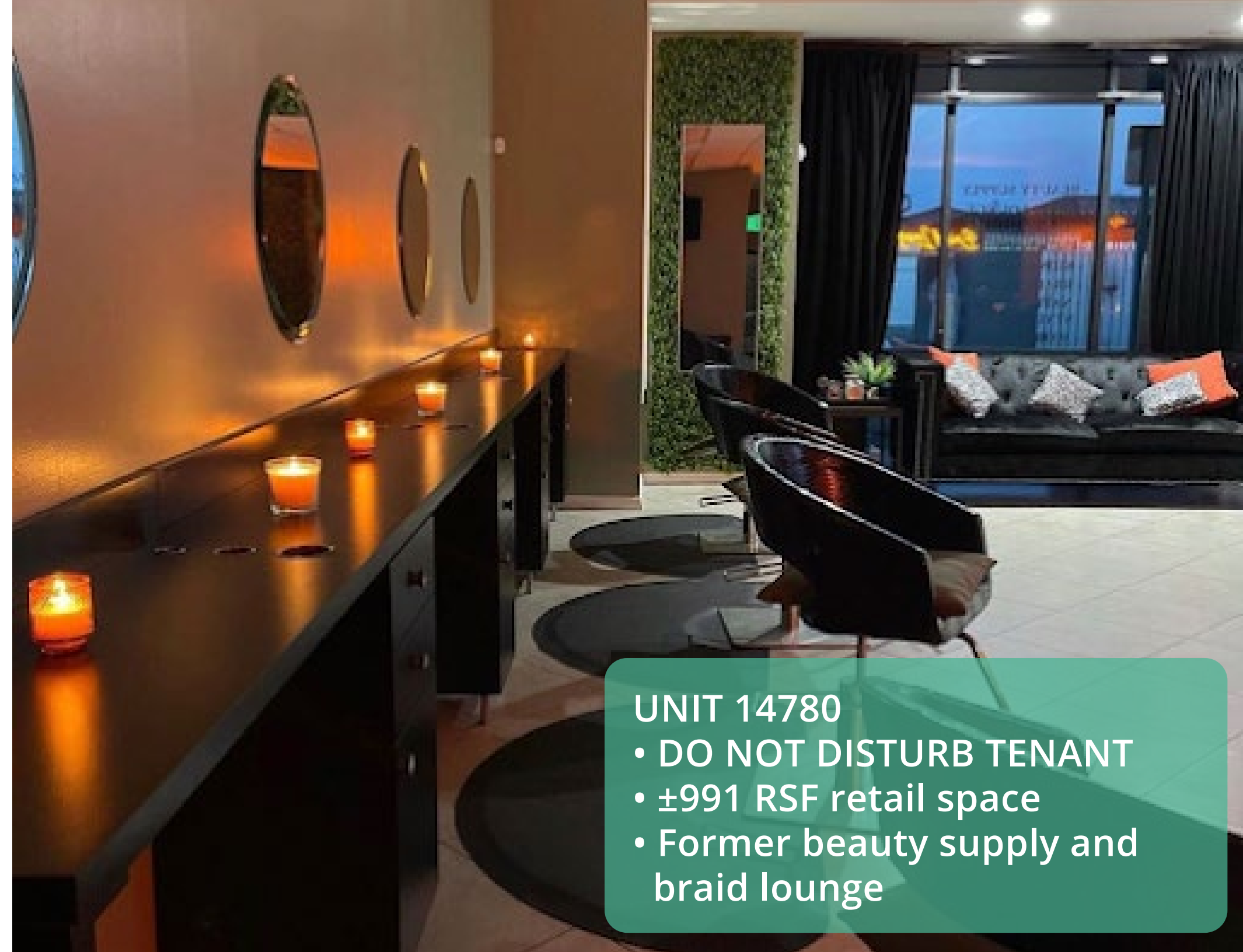
UNIT 14780 • DO NOT DISTURB TENANT • ±991 RSF retail space • Former beauty supply and braid lounge