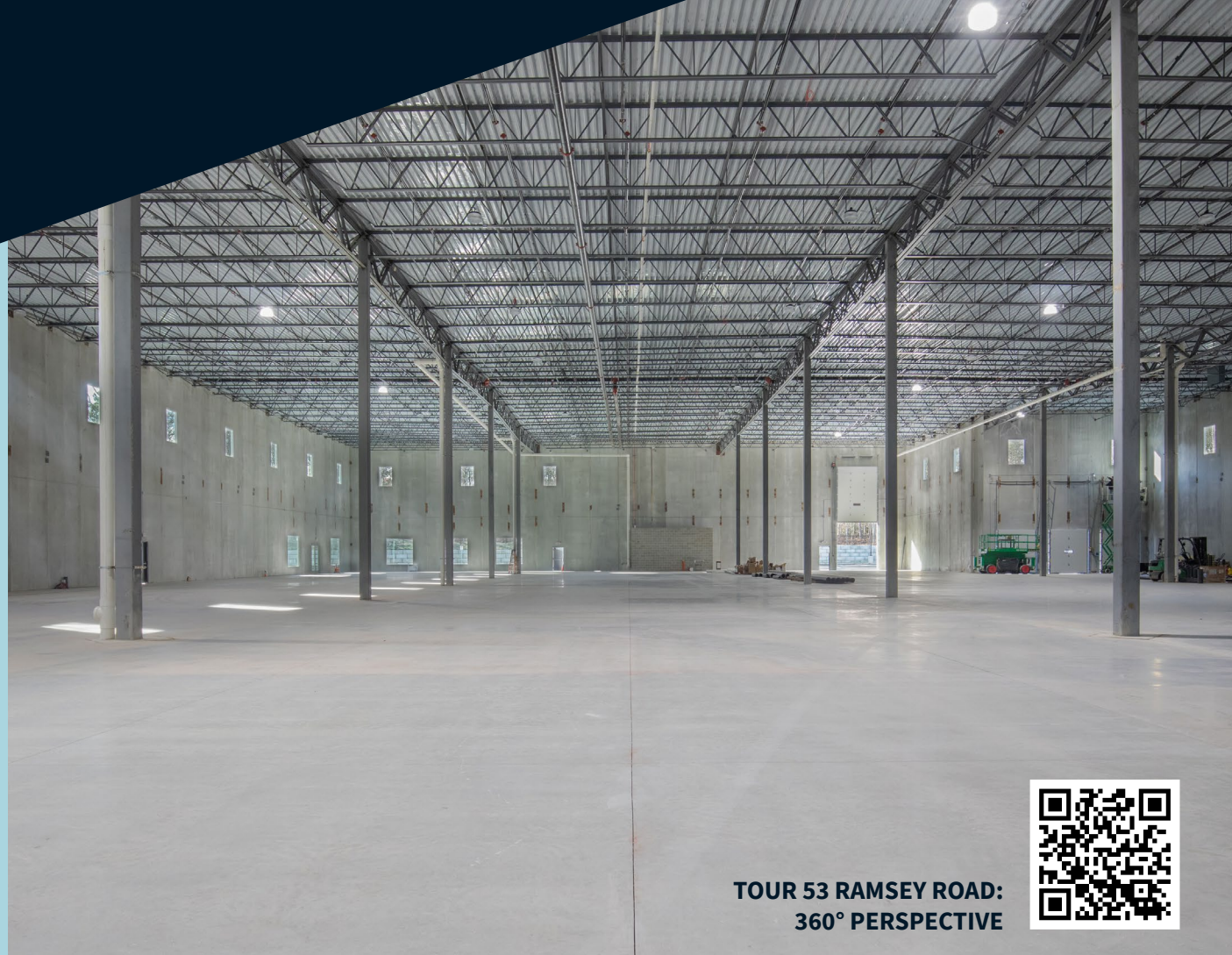
TOUR 53 RAMSEY ROAD: 360° PERSPECTIVE

For more information about local Brookhaven IDA Financial Incentives, visit: www.brookhavenida.org