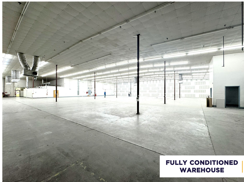
FULLY CONDITIONED WAREHOUSE