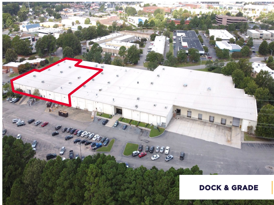
DOCK & GRADE