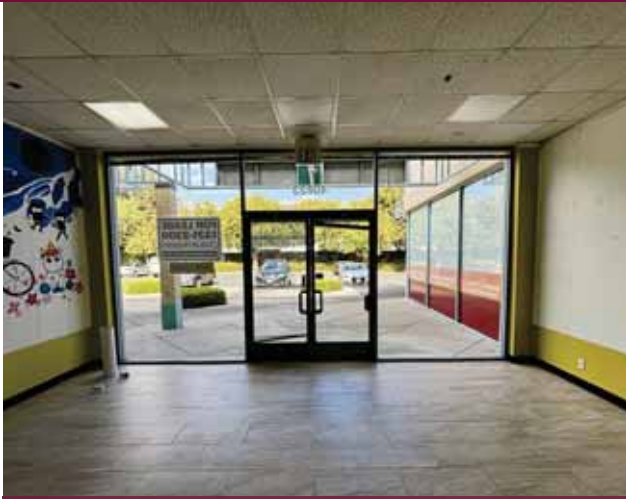
Interior - 40823 Fremont Blvd.