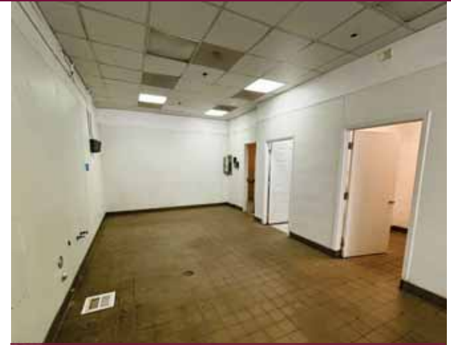
Interior - 40823 Fremont Blvd.