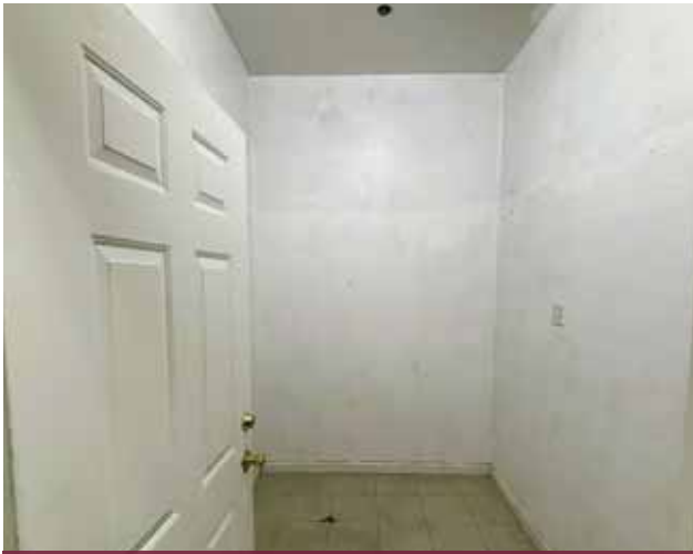
Interior - 40823 Fremont Blvd.