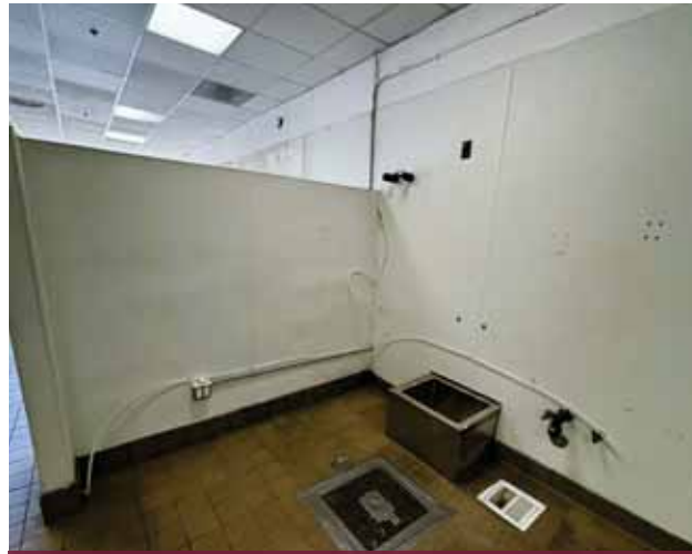
Interior - 40823 Fremont Blvd.