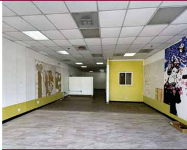
Interior - 40823 Fremont Blvd.