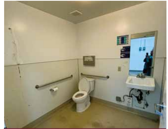
Interior - 40823 Fremont Blvd.