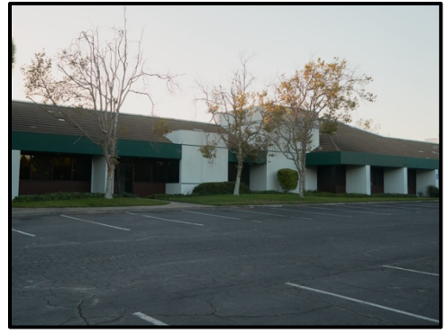
Off Street Parking