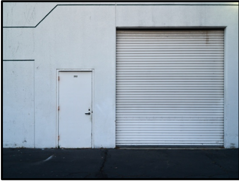
Easy Loading Roll Up Door