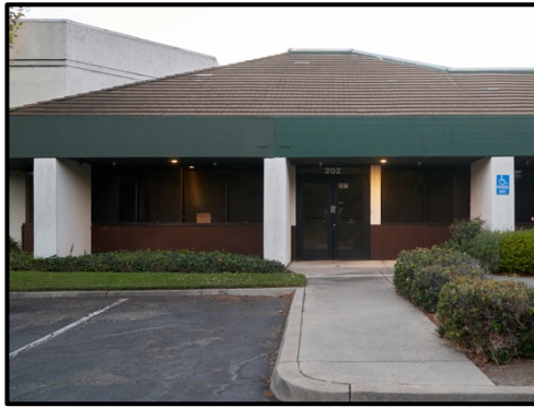
Customer Facing Entryway