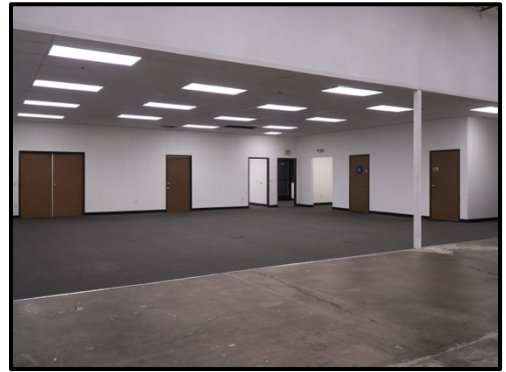
Flexible Open Office Space