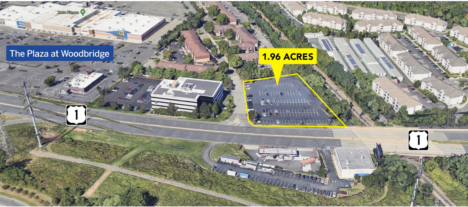
The Plaza at Woodbridge