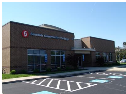
Community College, Mason, OH