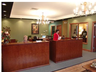
Surgery Center, Centerville, OH