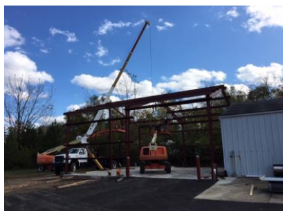
Industrial, Miamisburg, OH