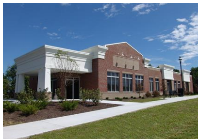
Medical Office Building, Union, KY