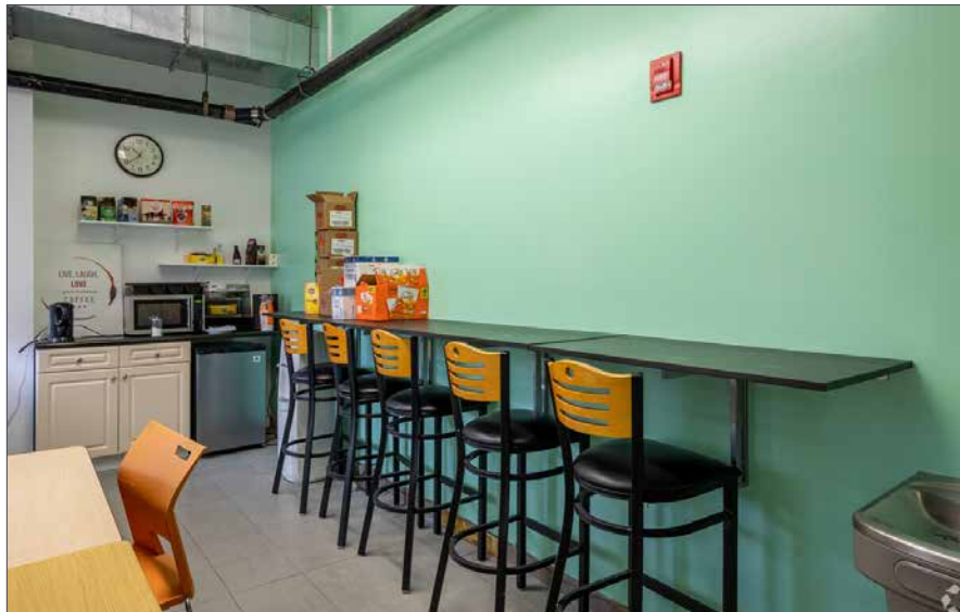
Furniture is not included in the lease terms.