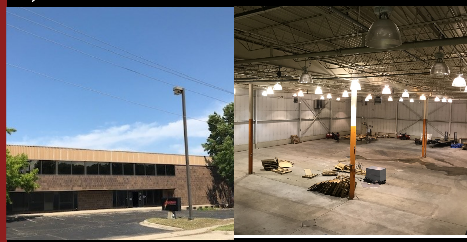
Office - Restaurant - School - Warehouse - Manufacturing!