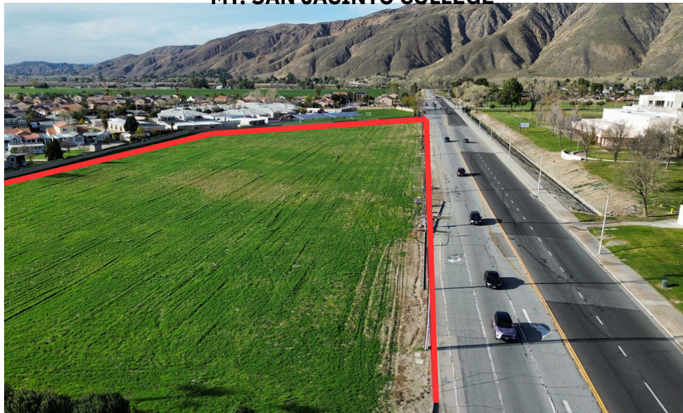
NORTH VIEW ACROSS FROM MT. SAN JACINTO COLLEGE