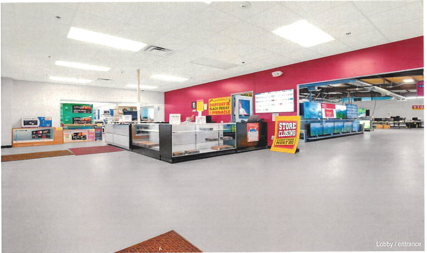
Lobby / entrance