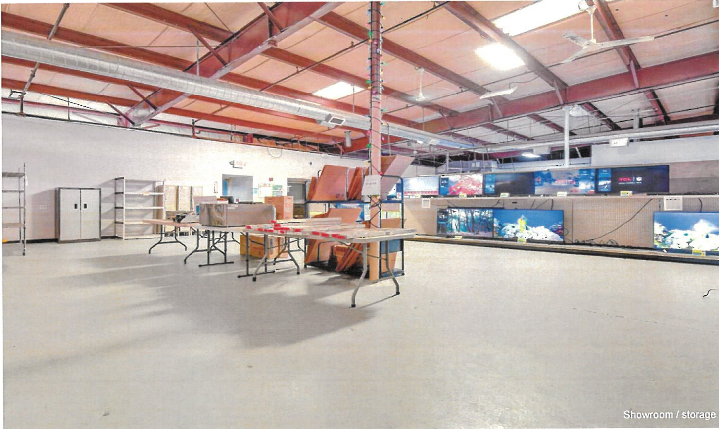
Showroom / storage