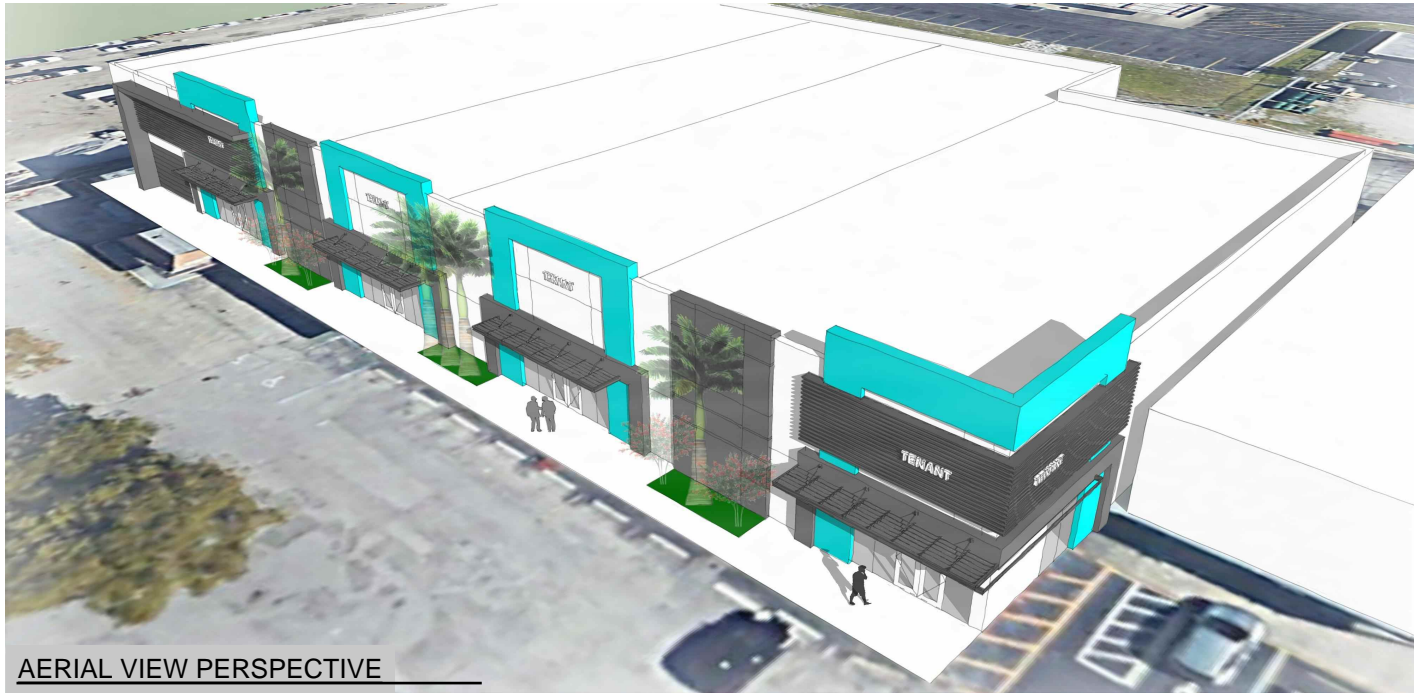
AERIAL VIEW PERSPECTIVE