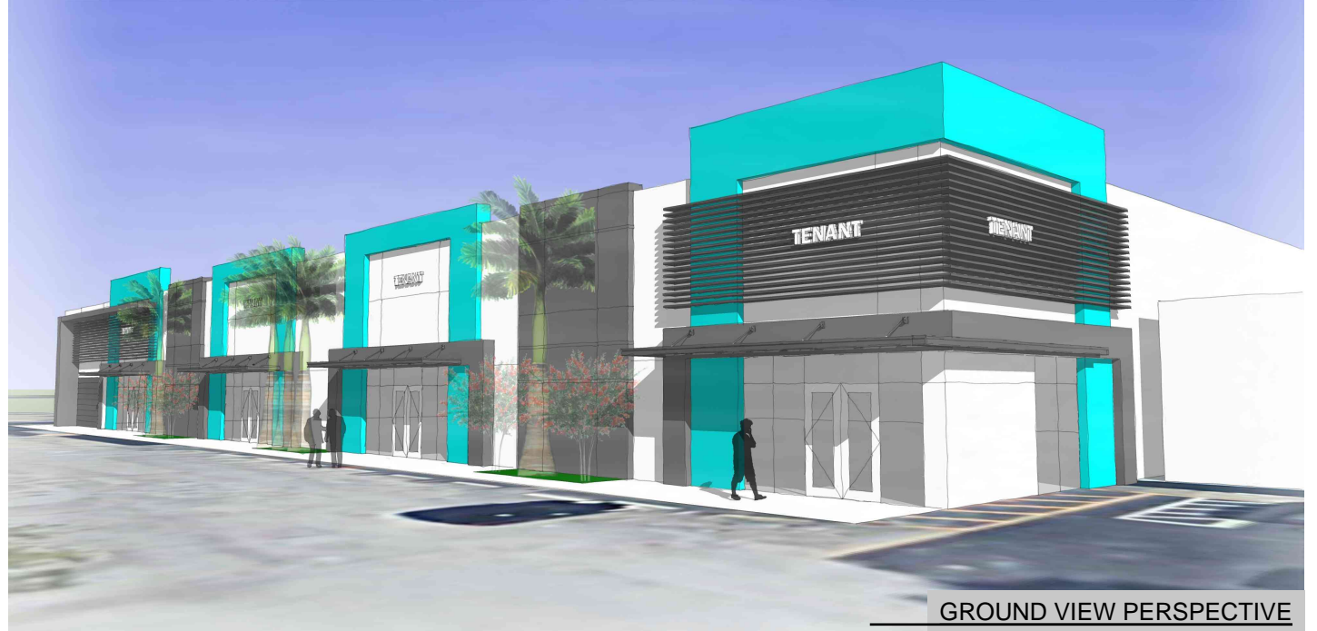
GROUND VIEW PERSPECTIVE