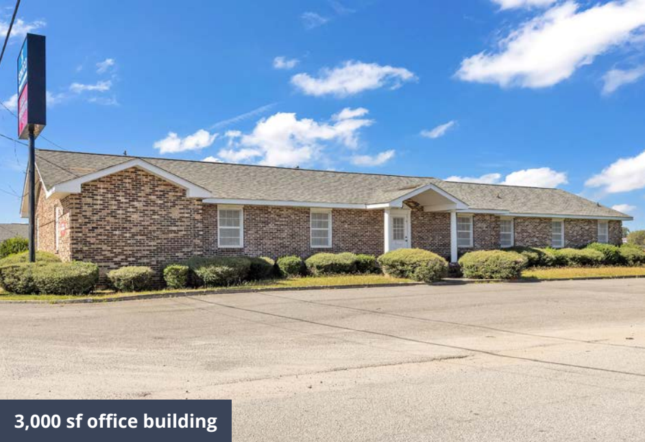
3,000 sf office building