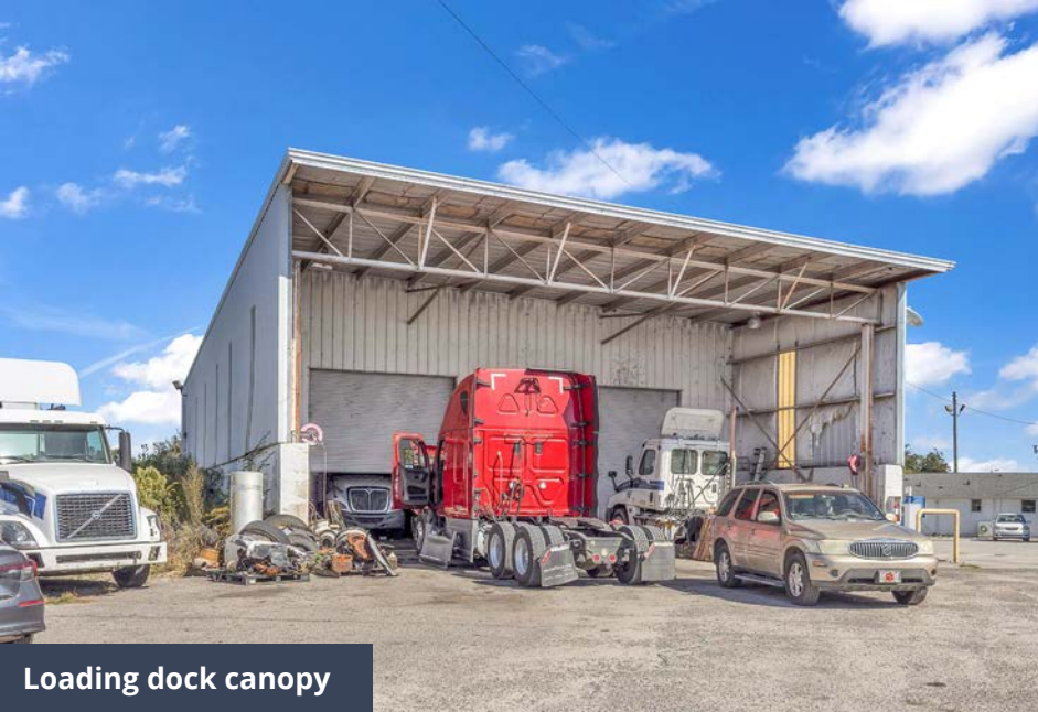
Loading dock canopy