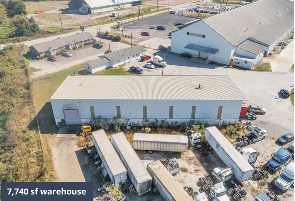
7,740 sf warehouse