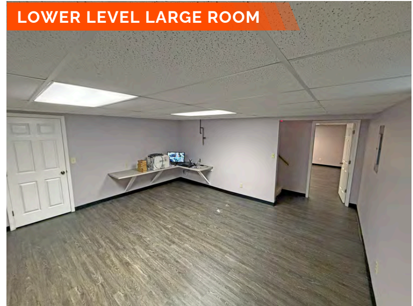
LOWER LEVEL LARGE ROOM