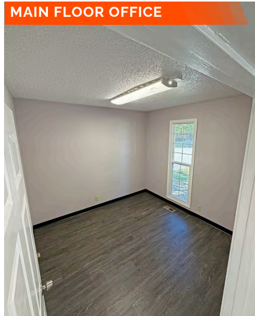
MAIN FLOOR OFFICE