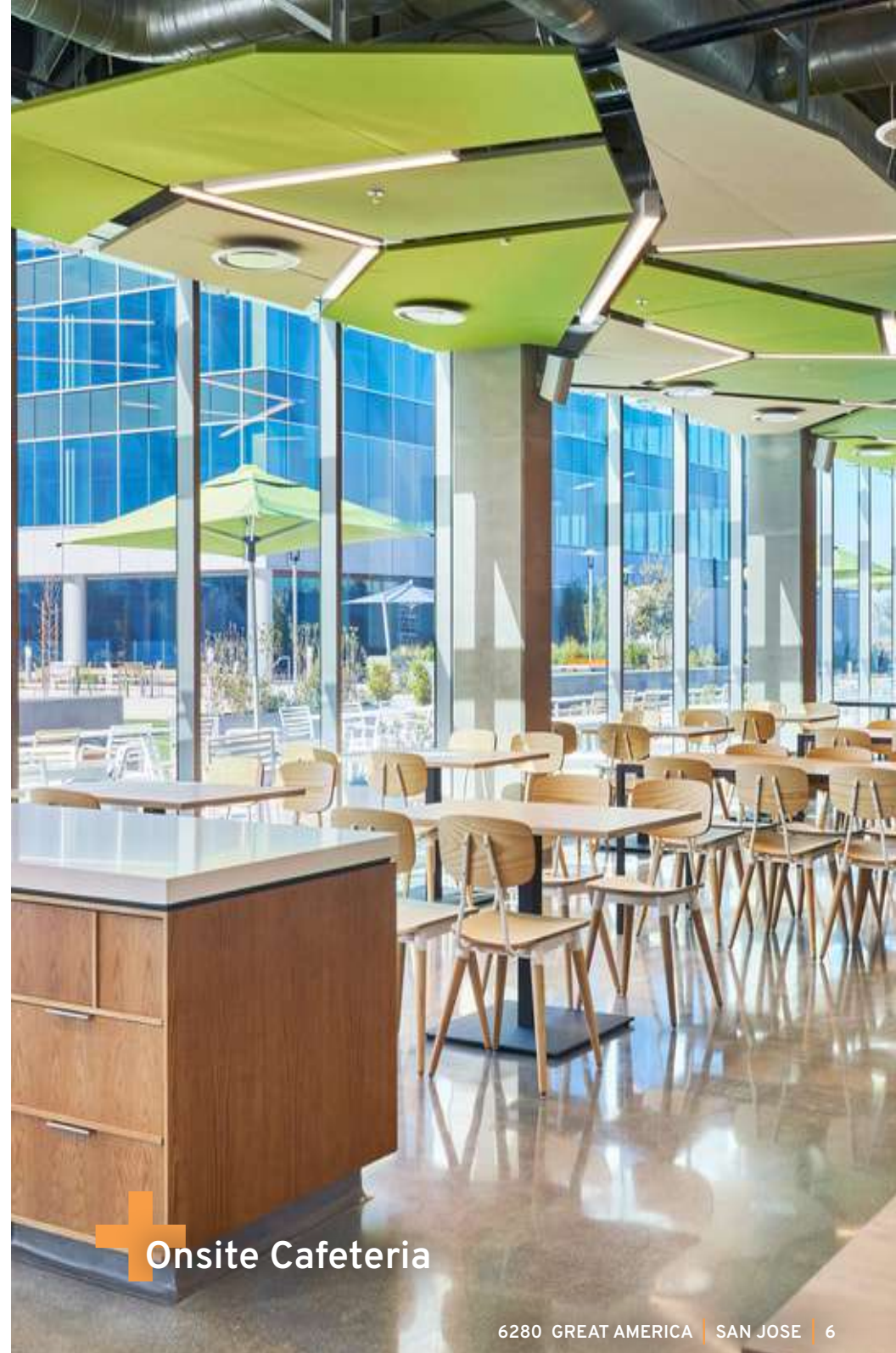
+ Onsite Cafeteria