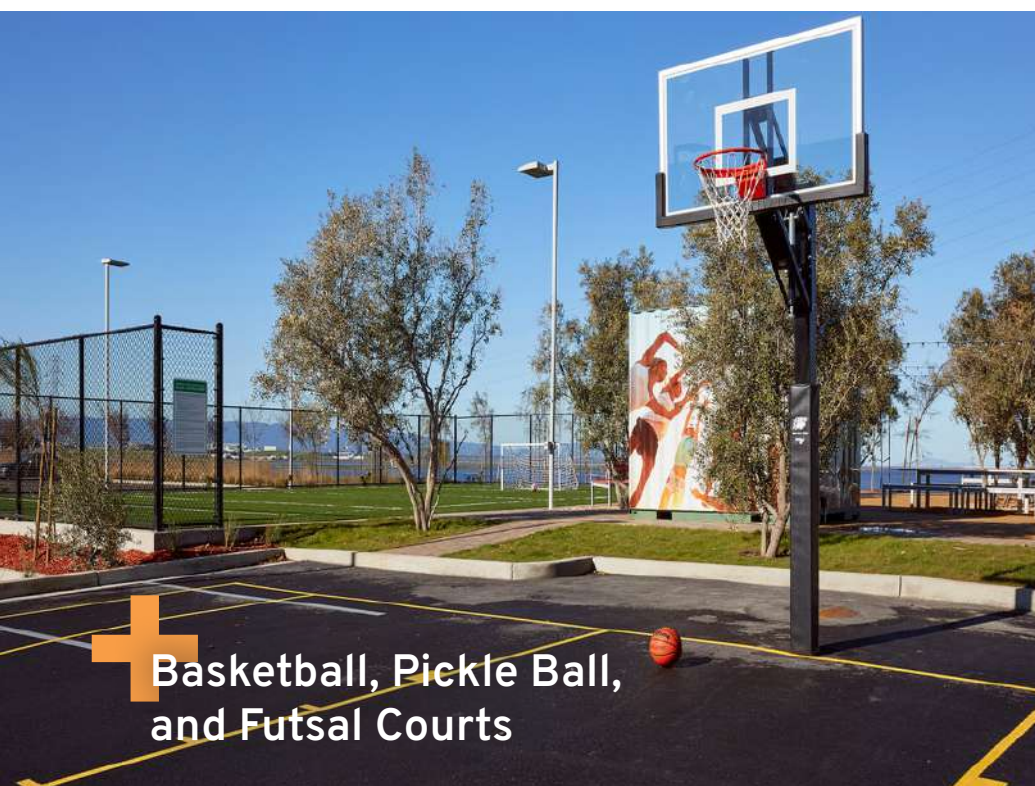
+ Basketball, Pickle Ball, and Futsal Courts