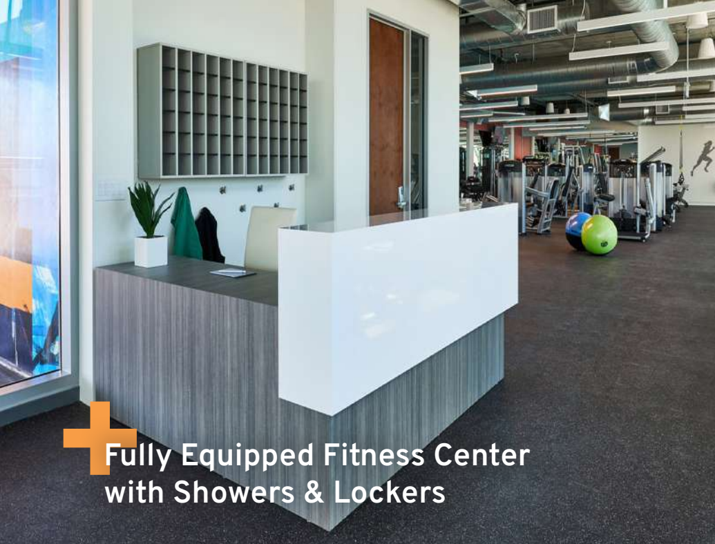
+ Fully Equipped Fitness Center with Showers & Lockers