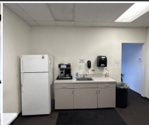
1 BREAK ROOM