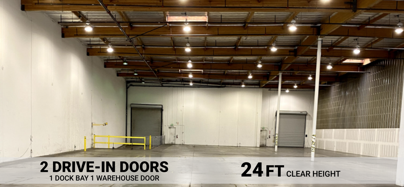
2 DRIVE-IN DOORS 1 DOCK BAY 1 WAREHOUSE DOOR