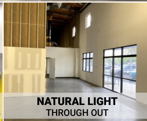
NATURAL LIGHT THROUGH OUT

Corner Unit Warehouse and Office Space for Rent with easy access to the 101 and PCH. This one-level open warehouse floor plan features 15,000 square feet with natural lighting, a clear height of 24', an indoor drive-in dock bay, and a separate drive-in door for straight-in warehouse access. Electrical outlets are located conveniently along many points along the walls and one building support pole.