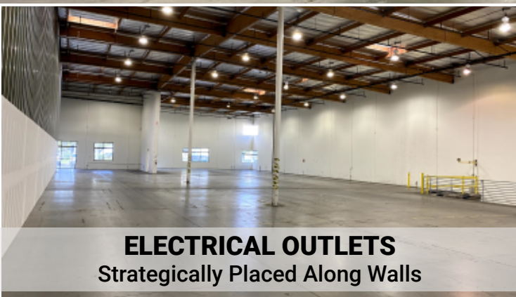
ELECTRICAL OUTLETS Strategically Placed Along Walls