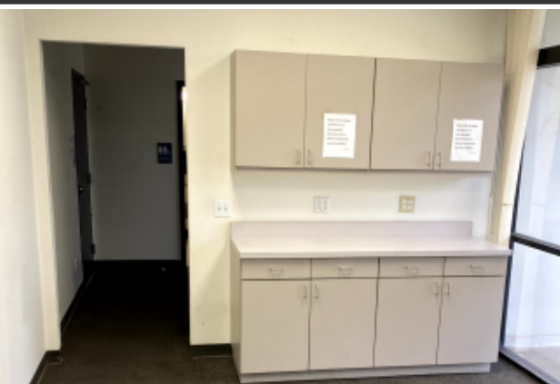
RESTROOMS IN UNIT

With entrances from three points in the building, you can enter the office/break room/restroom area directly from the parking lot, or from the warehouse. The ample parking lot has 30 regular parking spots, 2 handicapped spots and three concrete tables. That are perfect for lunches and breaks.