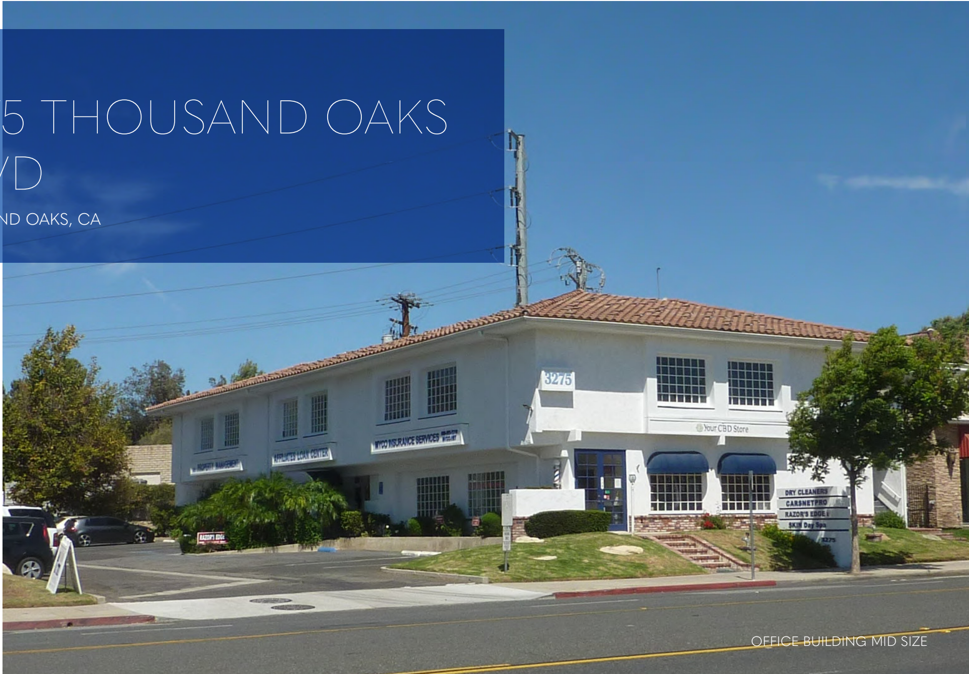
OFFICE BUILDING MID SIZE