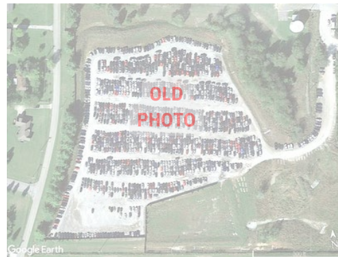
Gravel Lot Capability Example:

Billy Gibbs Liberty Commercial Realty, LLC (615) 812-2519 c billy@liberty-cr.com