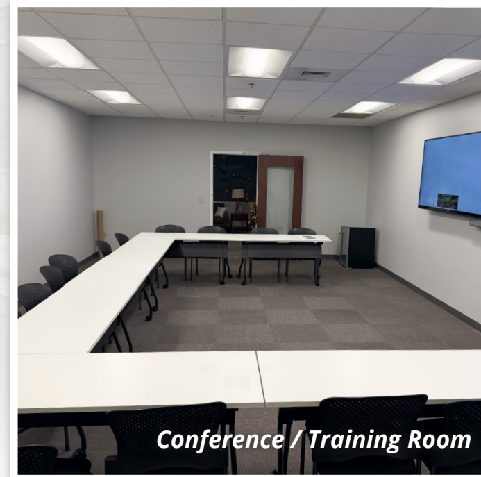
Conference / Training Room

10125 Berkeley Place Drive is a ±15,779 SF office building situated on ±4.089 acres in Charlotte, NC. Built in 2004 and zoned CC, the property offers a well-maintained, professional office environment with ample land and flexibility for a variety of office users. Its location provides convenient access to major interstates and surrounding business hubs, making it an ideal opportunity for owner-users or investors seeking a stable office presence in a strong Charlotte submarket.