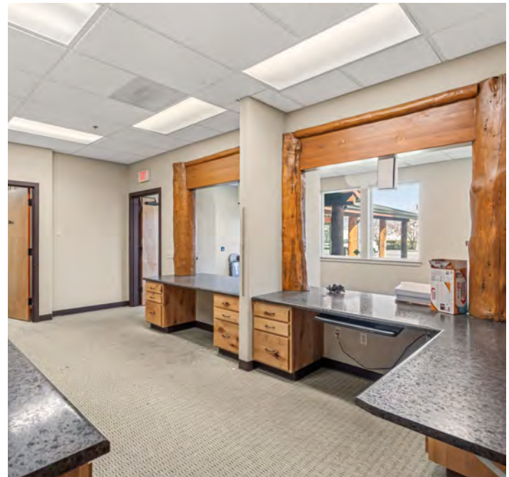
SUITE 112 • MEDICAL CLINIC