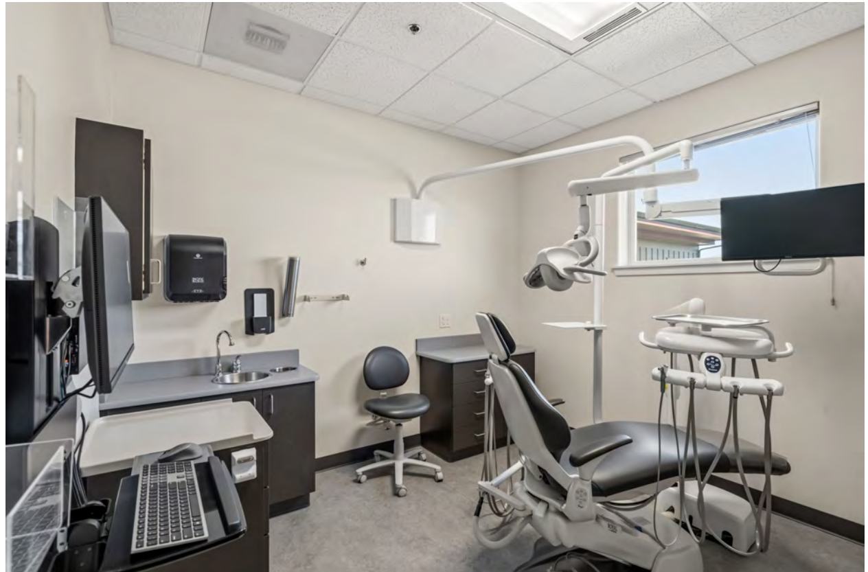
SUITE 224 • DENTAL CLINIC