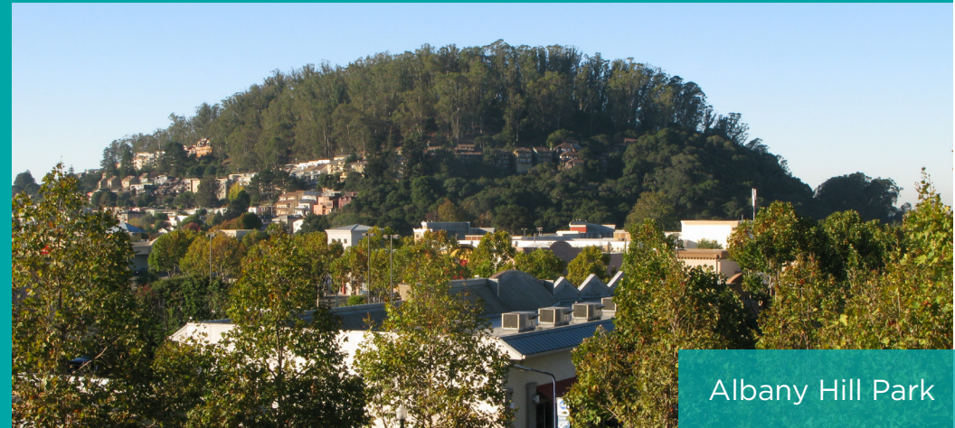
Albany Hill Park