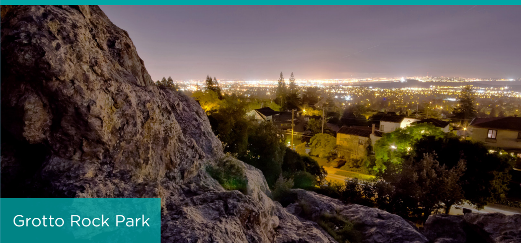
Grotto Rock Park