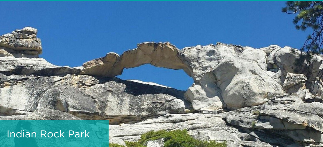
Indian Rock Park