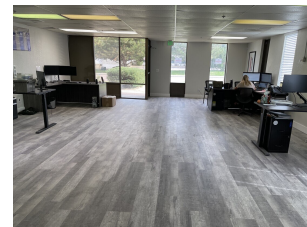
Open Office Space (Renovated 2018)