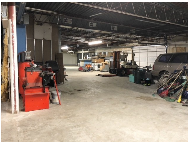
Interior — Warehouse Bay with Drive-In Access