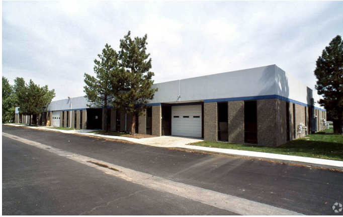
Exterior — Drive-In Doors & Loading Area