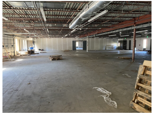
Interior — Open Warehouse (12 FT Clear)