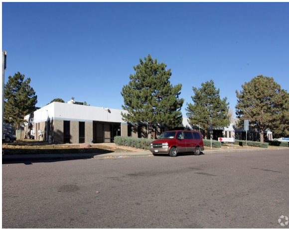
Exterior — Street View & Parking