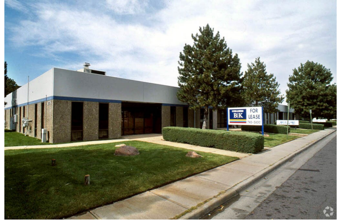
Exterior — Front Facade & Entry