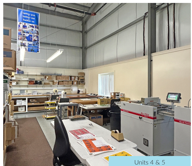
Units 4 & 5