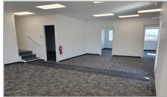
OFFICE SPACE Newly Remodeled