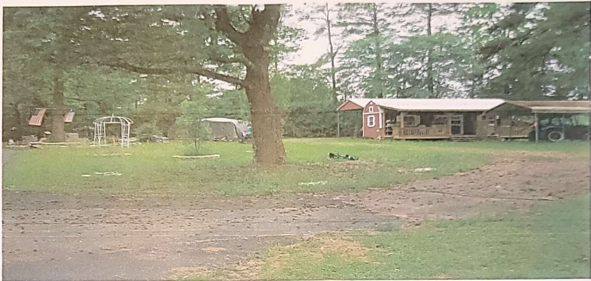
Front View for 16689 FM 1485 Road taken on 4-27-2021

If using the Elevation Certificate to obtain NFIP flood insurance, affix at least 2 building photographs below according to the instructions for Item A6. Identify all photographs with date taken; "Front View" and "Rear View"; and, if required, "Right Side View" and "Left Side View." When applicable, photographs must show the foundation with representative examples of the flood openings or vents, as indicated in Section A8. If submitting more photographs than will fit on this page, use the Continuation Page.