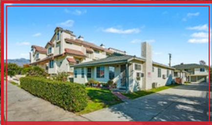
6036-6038 TEMPLE CITY BLVD