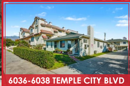
6036-6038 TEMPLE CITY BLVD