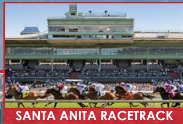
SANTA ANITA RACETRACK