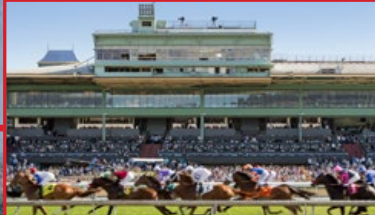
SANTA ANITA RACETRACK