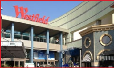
SHOPS AT SANTA ANITA