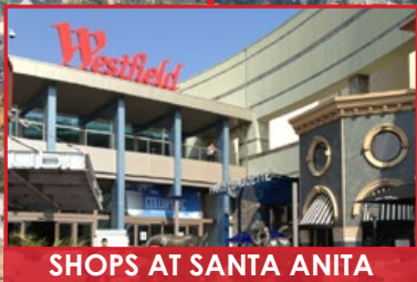
SHOPS AT SANTA ANITA