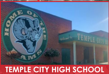
TEMPLE CITY HIGH SCHOOL