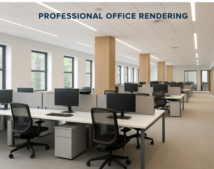
PROFESSIONAL OFFICE RENDERING

Take advantage of this 3,700 SF of commercial space. Discover unparalleled business opportunities in our building, constructed with a modern steel frame and featuring expansive open spaces in a vibrant and growing neighborhood. With easy access to parking and within walking distance of nearby neighborhoods, this prime location is ideal for launching or expanding your business.