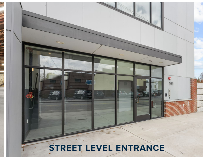
STREET LEVEL ENTRANCE