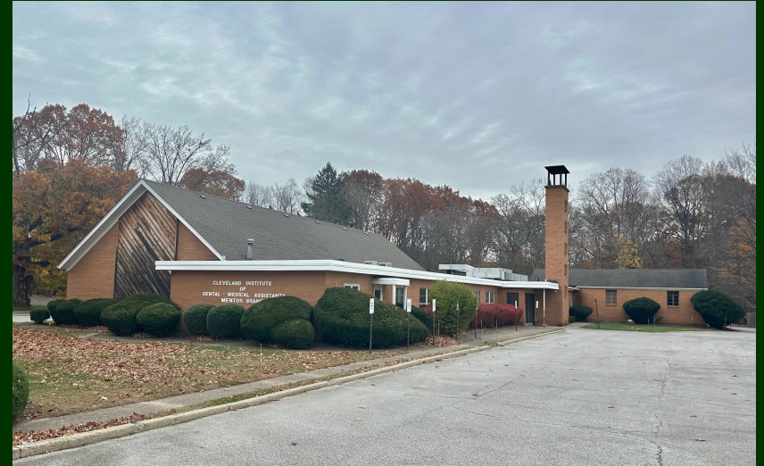
5723-5733 Hopkins Rd., Mentor, OH 44060

No warranty or representation, express or implied, is made as to the accuracy of the information contained herein. It is submitted subject to errors, omissions, price changes, rental or other conditions, withdrawal without notice, and to any special listing conditions imposed by our client.