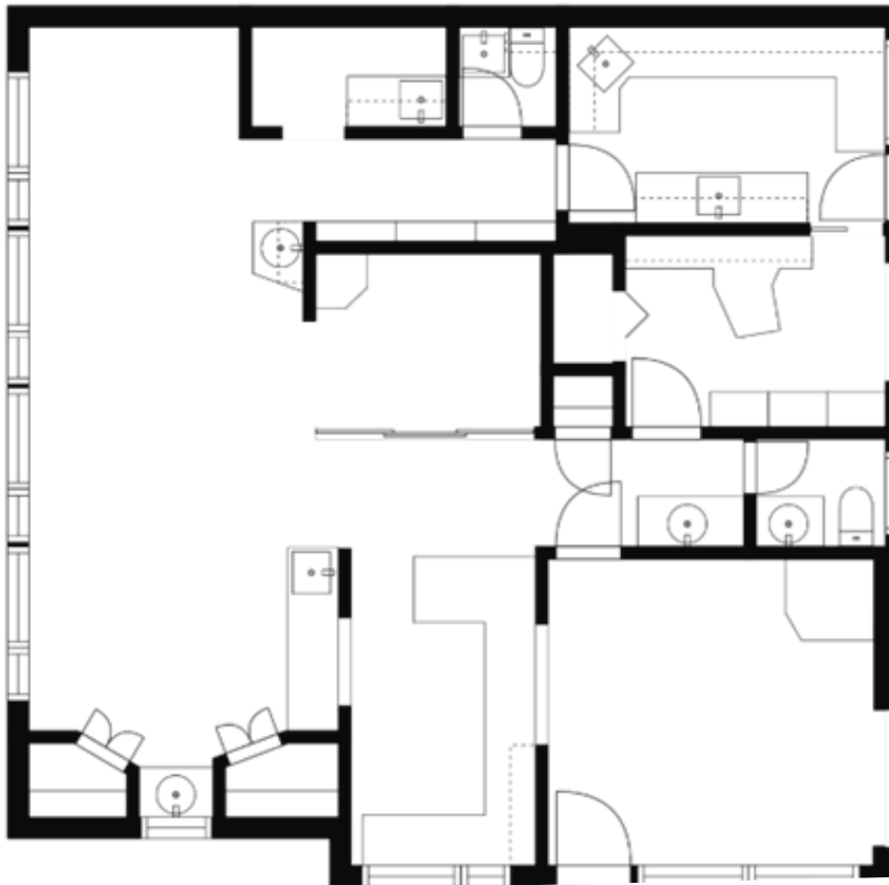
Suite 3A: 1,229 SF

Highlights: Building 3 Consists of 2 Dental Offices: Suites 3A, 3B