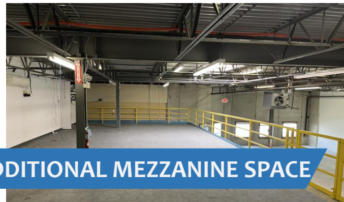
ADDITIONAL MEZZANINE SPACE