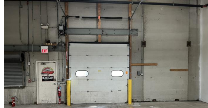
PRIVATE DRIVE-IN DOOR