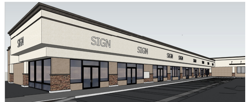
Corner Perspective Strip Building