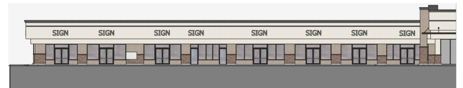
Strip Building Storefront