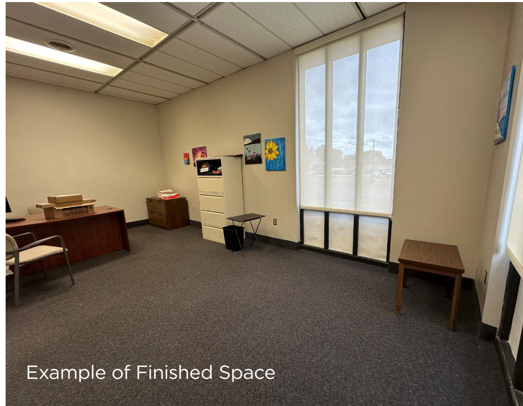
Example of Finished Space