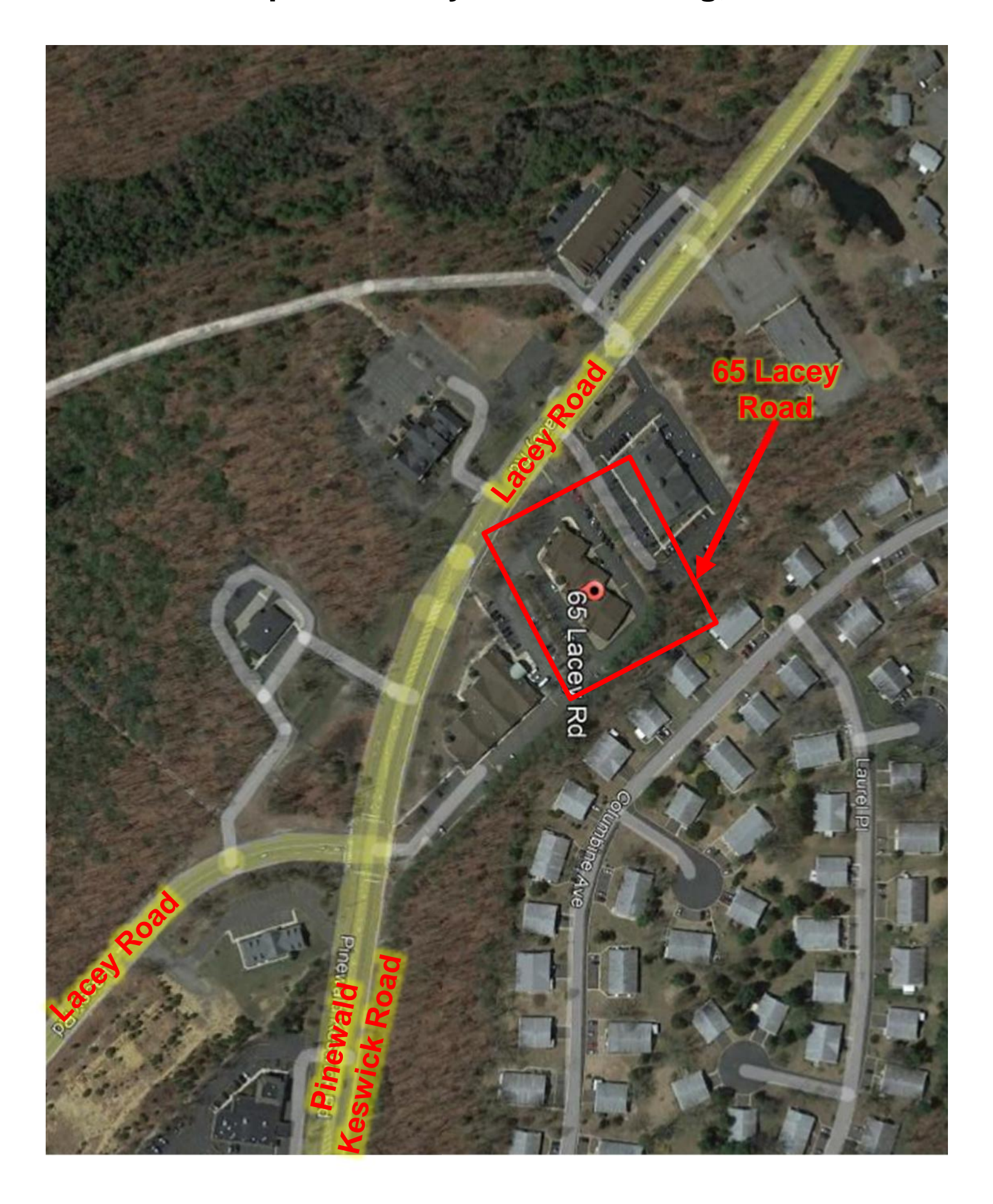
Map – 65 Lacey Road – Whiting, NJ