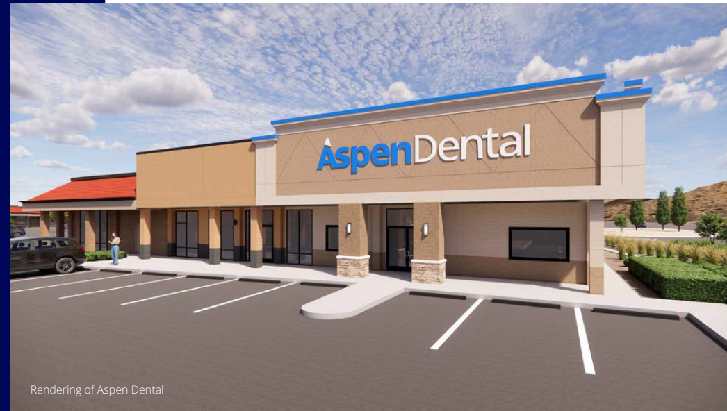
Rendering of Aspen Dental

Eagle Station shopping center has been anchored by Raley's Supermarket for over 40 years and features over 940 linear feet of frontage along Highway 395, the main thoroughfare in Carson City. Kohl's regional location draws visitors to the center from Carson City, Douglas County and South Lake Tahoe.