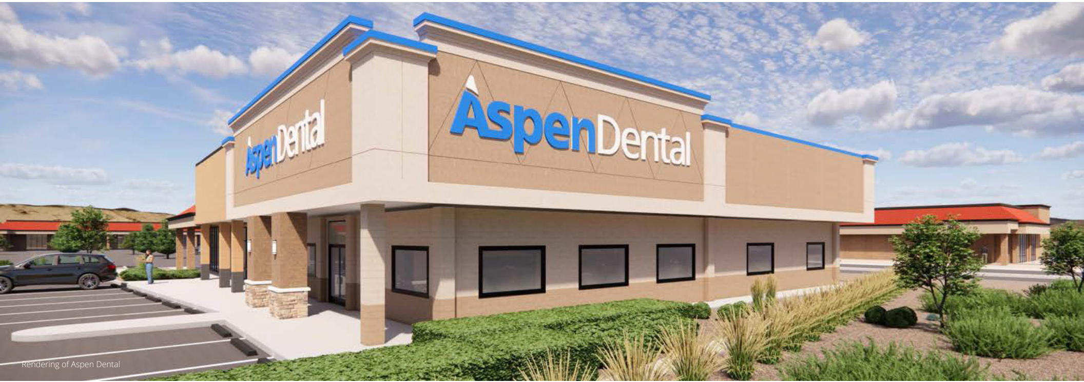
Rendering of Aspen Dental