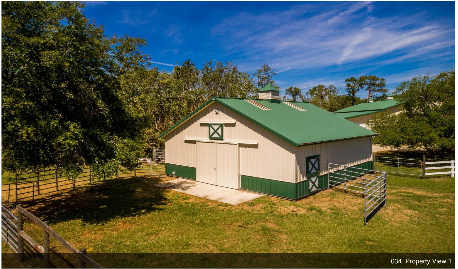
034_Property View 1