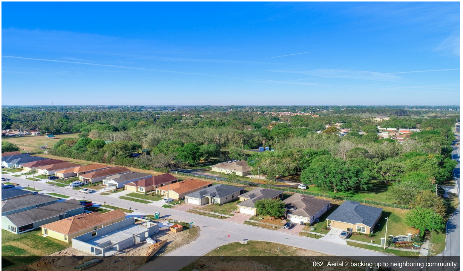
062_Aerial 2 backing up to neighboring community