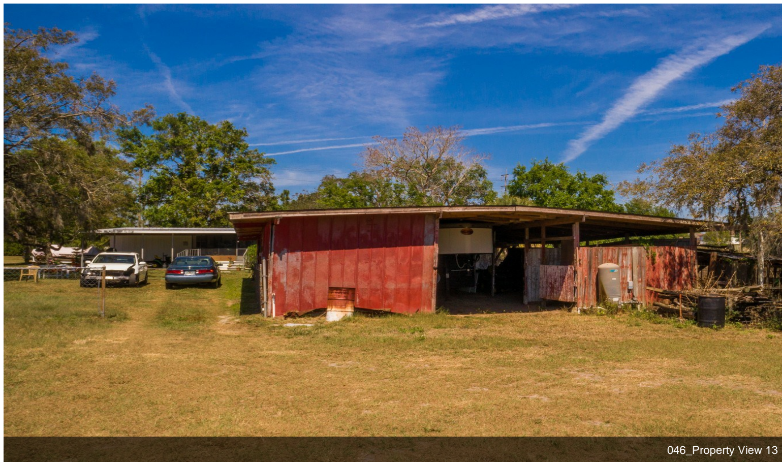
046_Property View 13