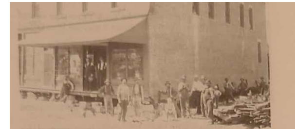
Raising the old Wangsness building to street level 1890

When the town of Garretson was young, business was very good, but, there was a lot of instability and many businesses opened and closed and changed owners. With the opening of the state and new towns many people were trying new ventures and sometimes they found it wasn't what they wanted. There were several reports of businesses that simply never enjoyed the patronage they thought was forthcoming. Specifically people would induce a party to start or take over a business by telling them what a good business it was then those same people would not patronize the new business. Several times the local paper took the citizens to task for this practice.