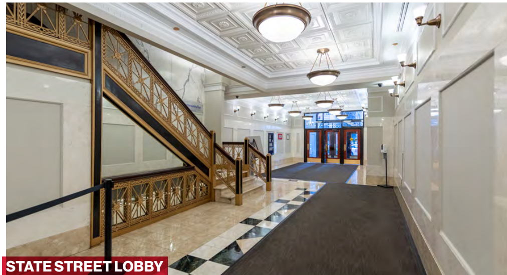
STATE STREET LOBBY